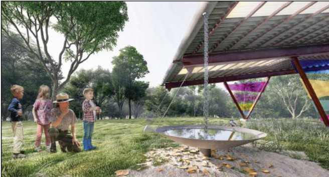
Rendering courtesy of Norman D. Ward